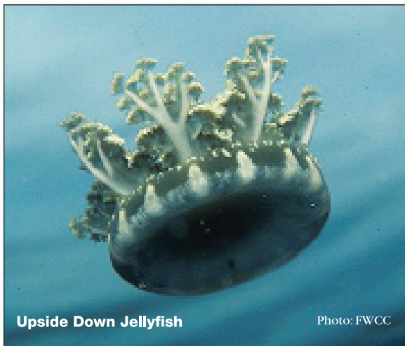
Upside Down Jellyfish