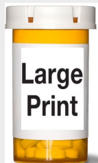
Ask for large print labels