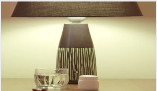
Use proper lighting