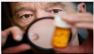
Use a magnifier